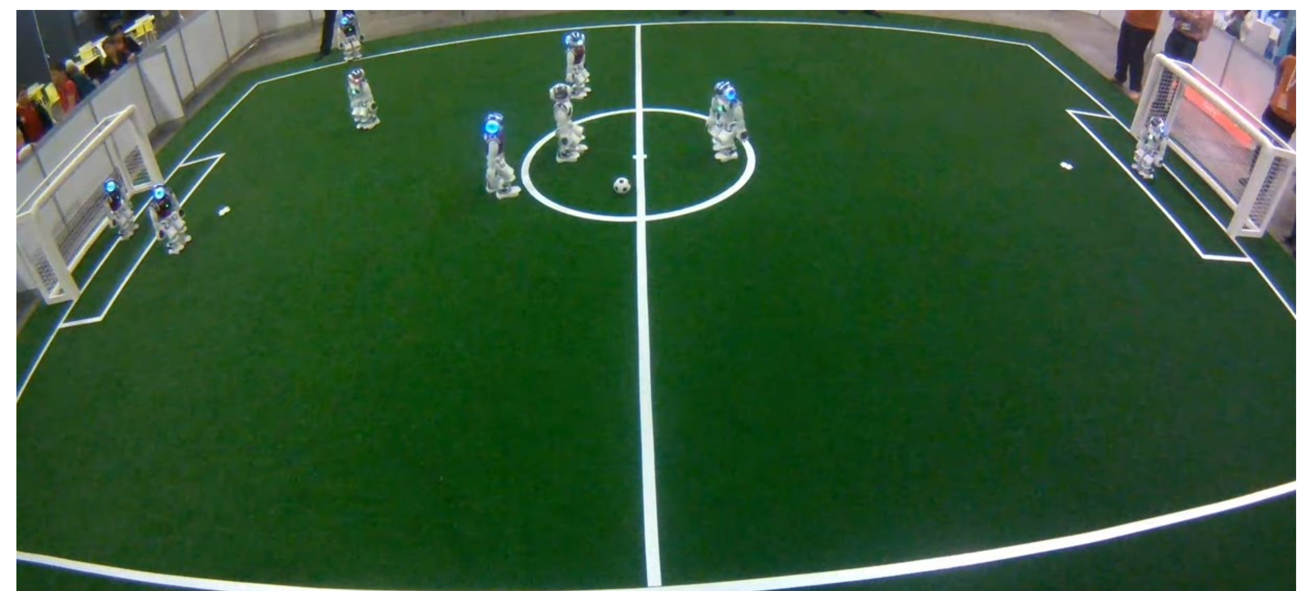
An official RoboCup match between two teams of 5 robots each. (A penalised robot can be seen on the far side for illegal actions)