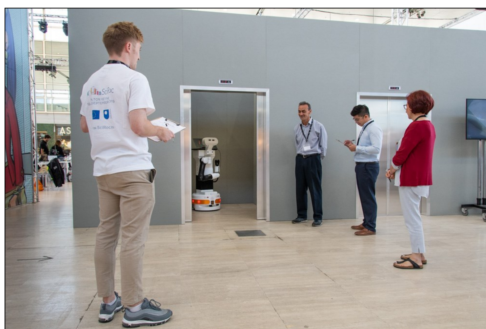
The robot is in the elevator, waiting to exit at the correct floor.