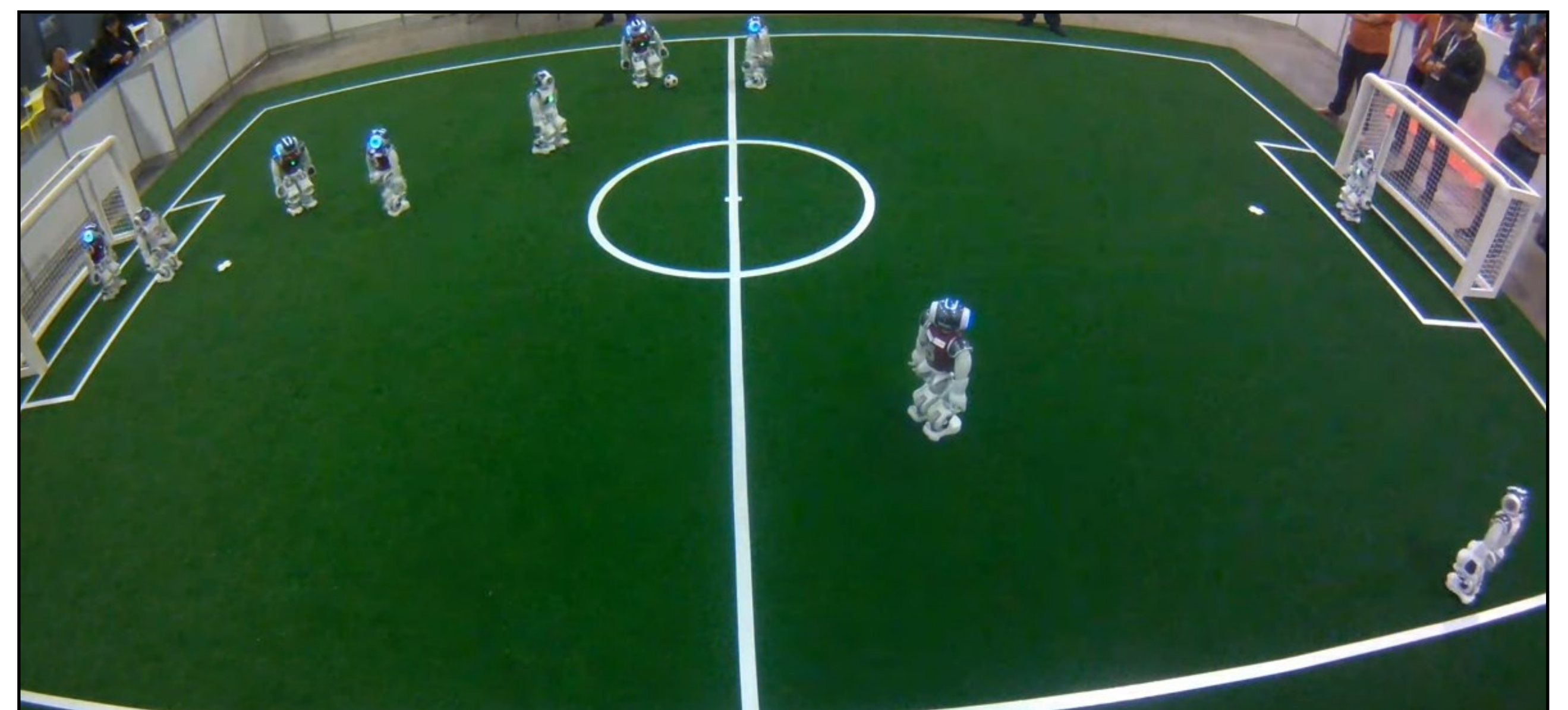
One robot moved in advance and is now ready to receive a pass.