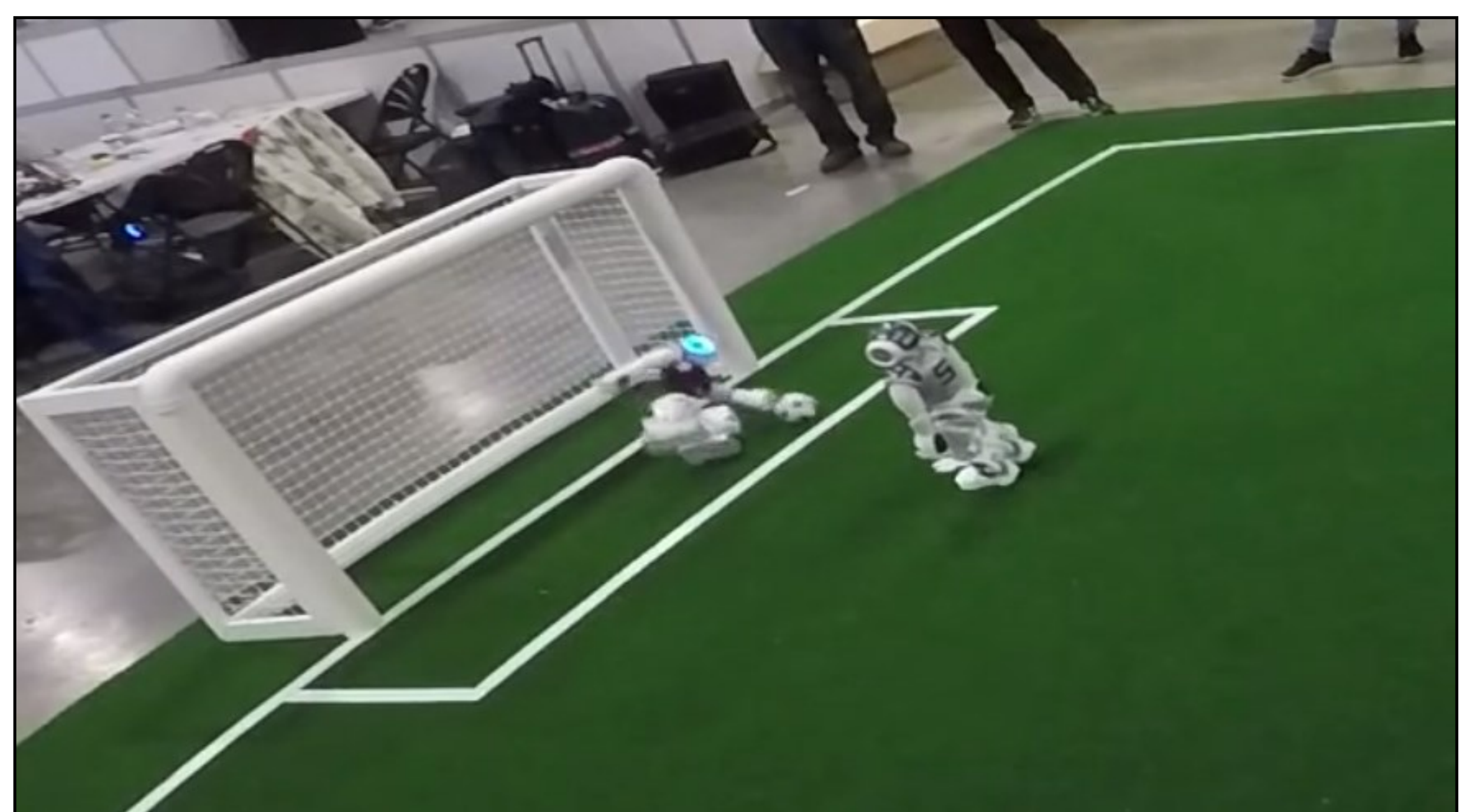
A robot dives to keep the ball from entering the goal.