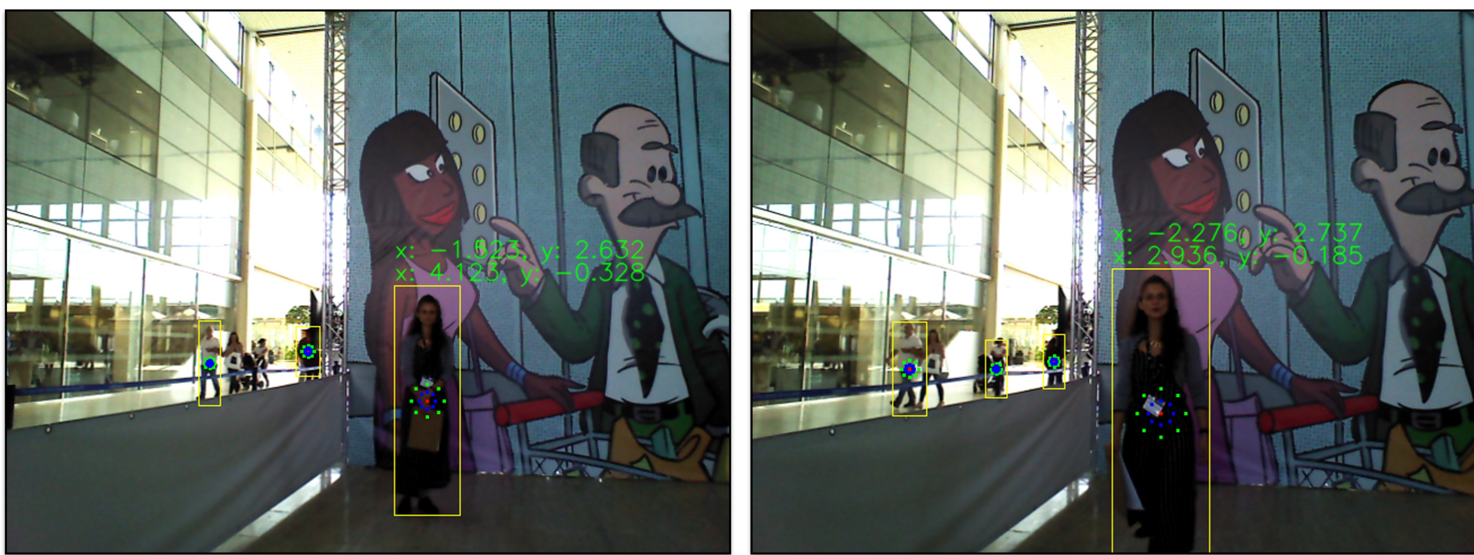
A processed image, providing distance and position estimation of the person. This allows the robot to detect motion.

I worked with the Robocup team of Sapienza University of Rome and was in charge of developing the A.I. for the 2 midfield roles out of 5 total soccer robot roles as well as the A.I. to handle special cases such as goal free kicks and side kick-ins. The A.I. I developed enabled the robot to play autonomously at all times.