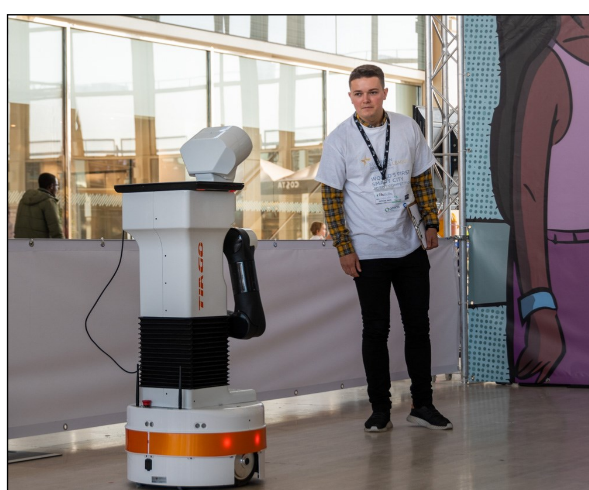
The robot finds a person and looks at their face when speaking.