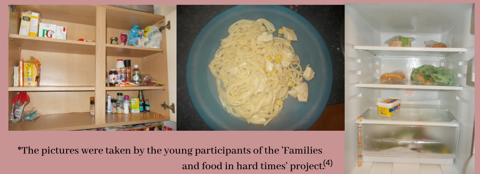
*The pictures were taken by the young participants of the 'Families and food in hard times' project! (4)