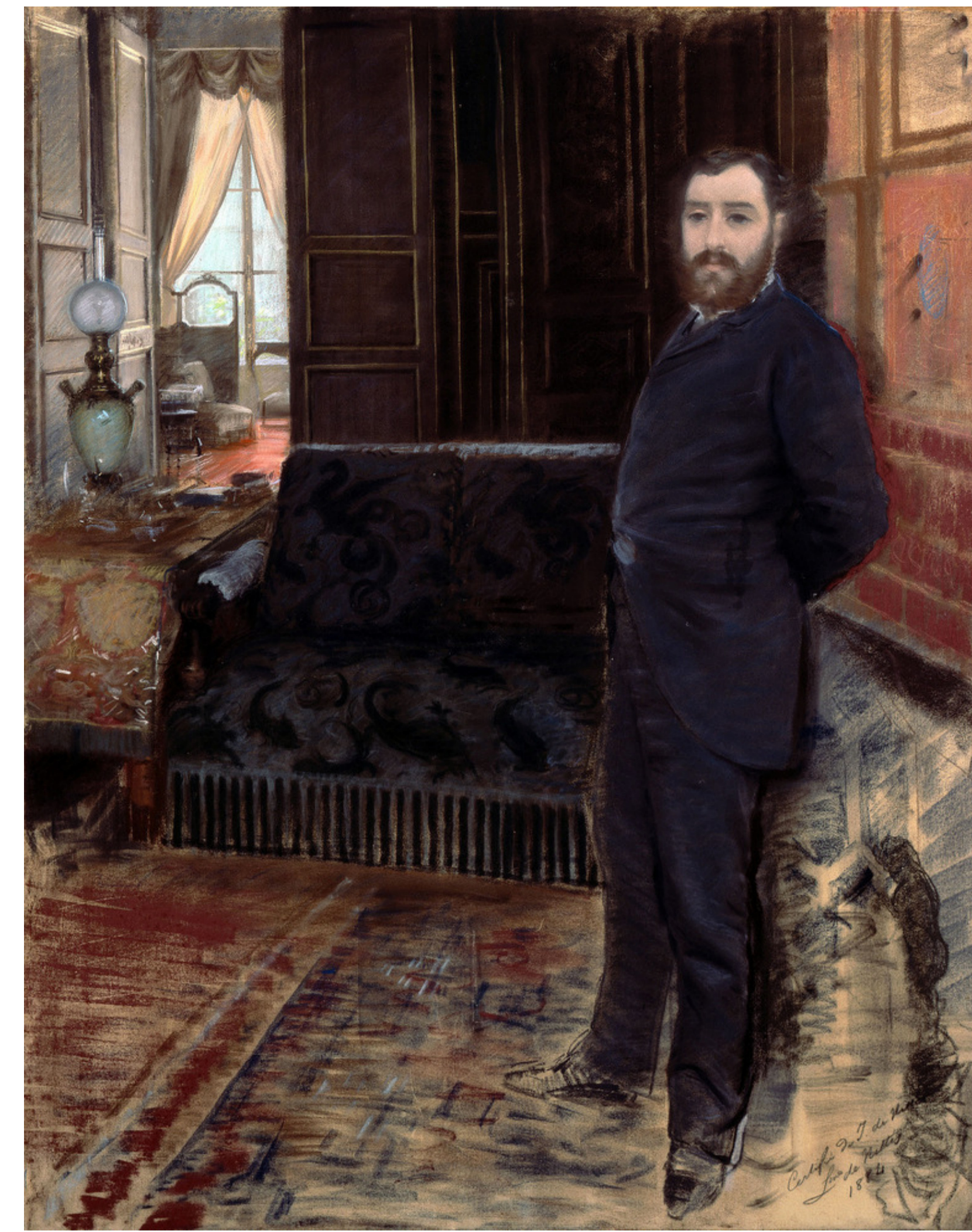
Autoritratto , Barletta, Pinacoteca De Nittis, 1883-4, pastel, 116x88 cm