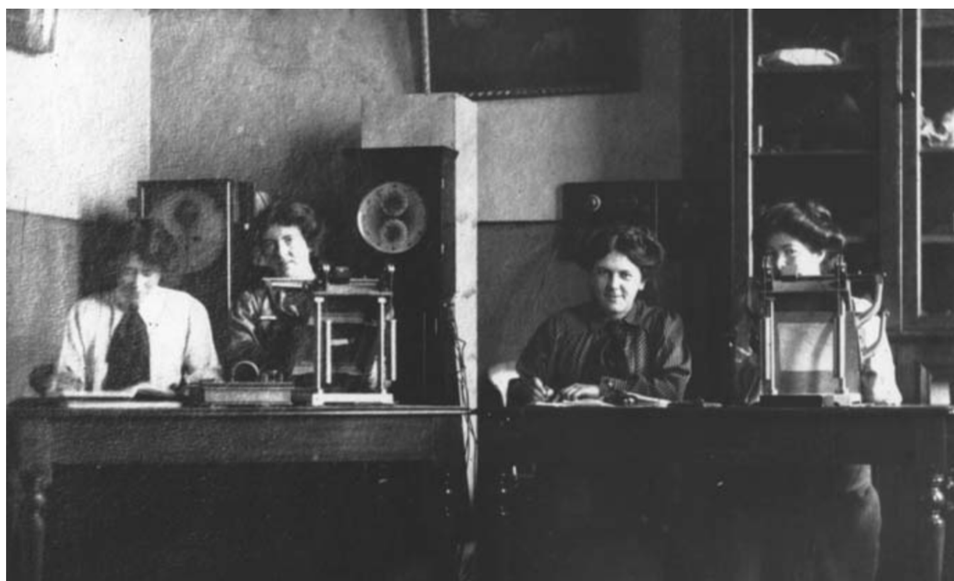
Above: Edinburgh Measurers c.1911

Ordinary women are often not acknowledged for their contributions to scientific achievement. Historically, if a woman's work is recognised, she is almost always described as a 'trailblazer'. This trend in the history of science, where progress is viewed almost exclusively in the light of the solitary genius, excludes the everyday women of astronomy. Very rarely are they or their vital calculations and measurements recognised. There is no better example of such forgotten women than the female computers employed on the Astrographic Catalogue.