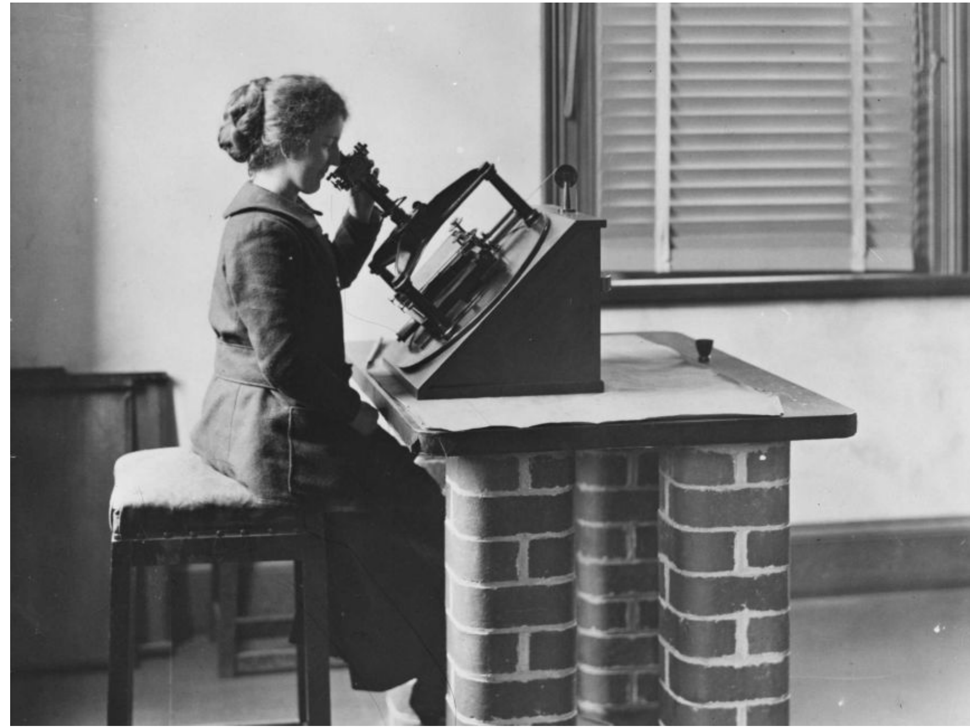
A female computer working at Melbourne Observatory, c.1905.

Ordinary women are often not acknowledged for their contributions to scientific achievement. Historically, if a woman's work is recognised, she is almost always described as a 'trailblazer'. This trend in the history of science, where progress is viewed almost exclusively in the light of the solitary genius, excludes the everyday women of astronomy. Very rarely are they or their vital calculations and measurements recognised. There is no better example of such forgotten women than the female computers employed on the Astrographic Catalogue.