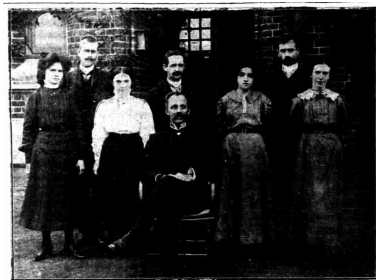
Left: Staff of Perth Observatory, 1910 (Sunday Times, Perth, May 1st 1910) Women are now considered 'staff'.