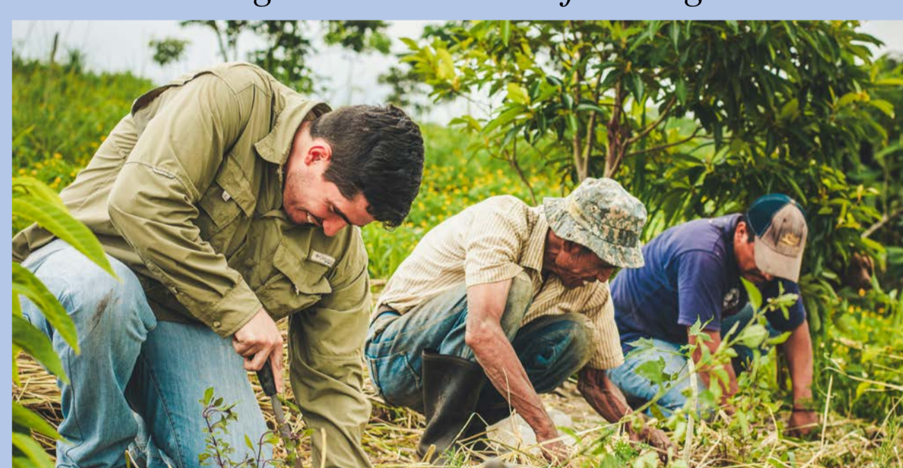
Figure 3: Agricultural training taking place at the SERES Finca