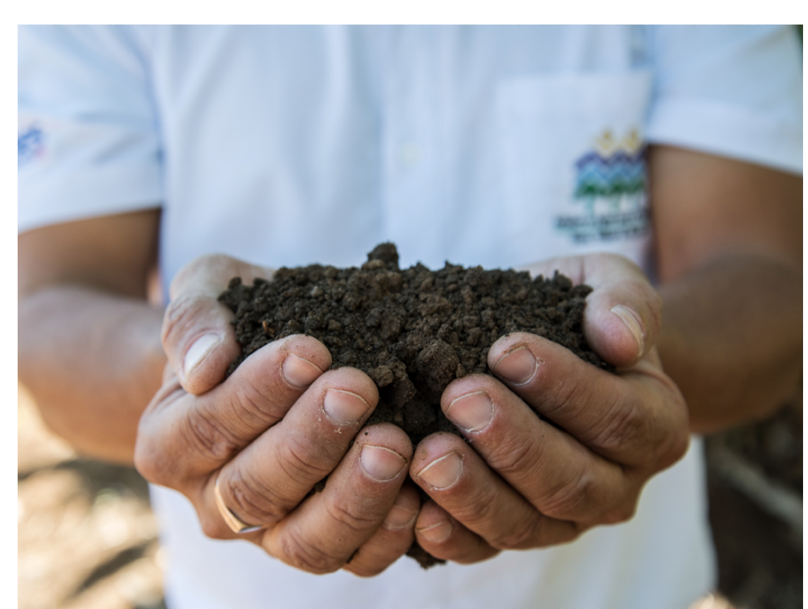
Figure 4: Connection between people and environment

'Local people really know what is best for them, and it's as easy as that.' - Gemara Gifford