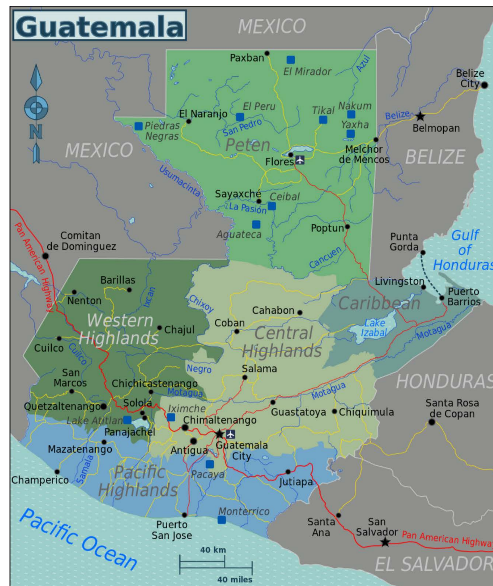
Figure 1: Map of Guatemala