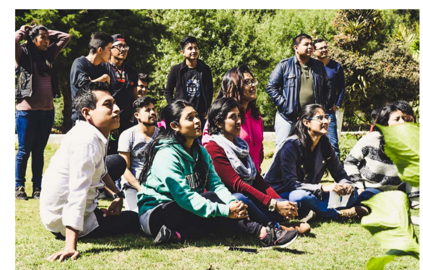
Figure 5: SERES leadership training

It was mentioned that racism against Indigenous peoples in Guatemala is extremely pervasive, and this contributes to their experiences not being paid adequate attention by government. Several interviewees agreed that well-off people in the cities in Guatemala live very different lives to those in rural areas, many of whom are subsistence farmers. The people who hold the most political power live lives that are much less affected by climate change, thus creating a significant social divide and the continuation of extremely poor living conditions for many in rural areas, which NGOs aim to improve.