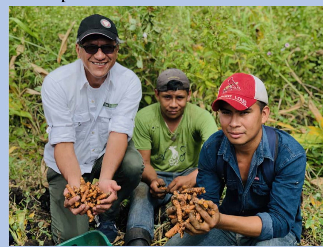
Figure 2: Turmeric farming

Physical infrastructure such as equipment for sustaining adaptive agricultural practices, e.g. cold rooms to store fruit and non-industrial greenhouses, ensures that communities have the resources to continue their new practices. Providing communities with skills and training also empowers them to be able to continue.