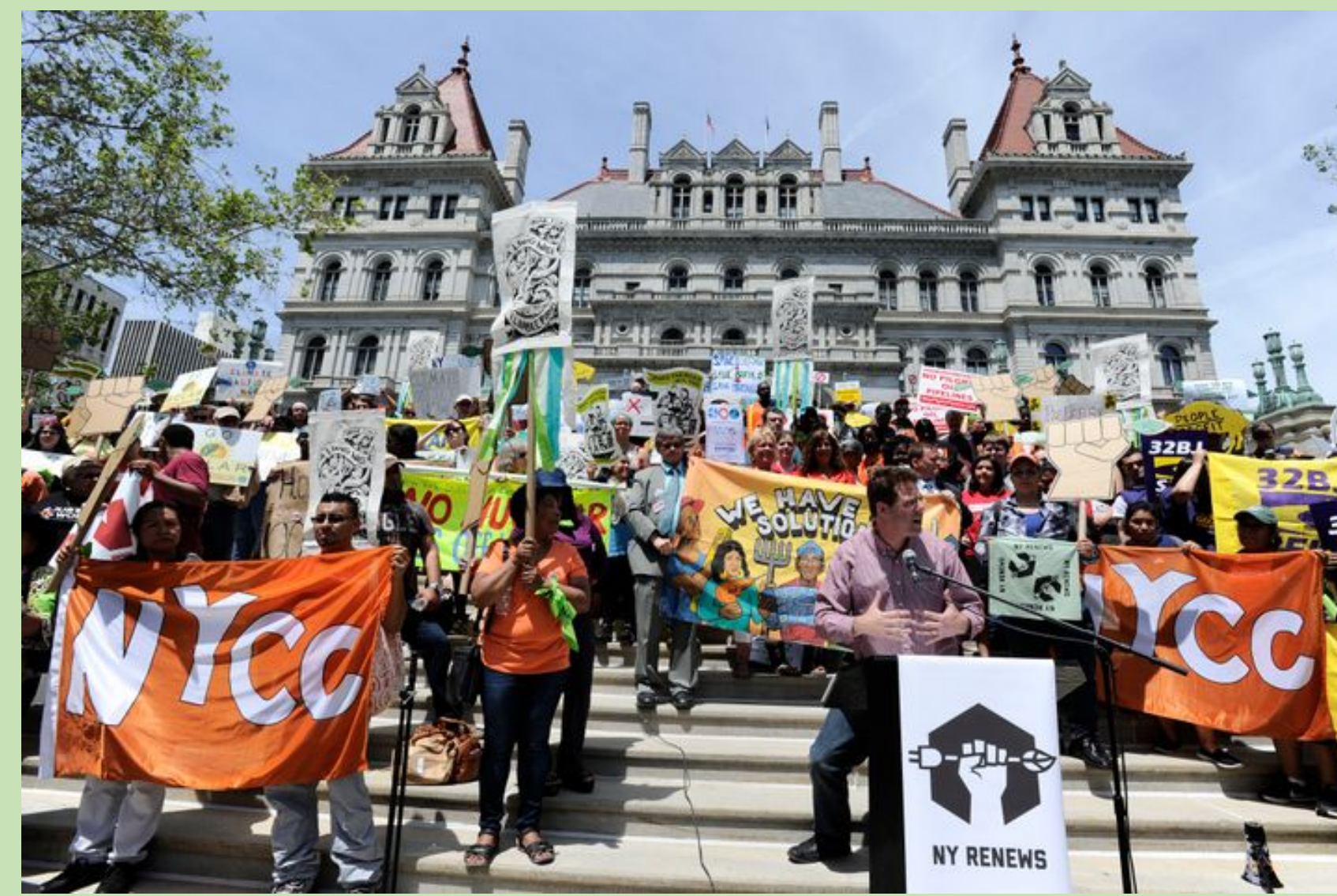
Environmental protesters in Albany in 2016.