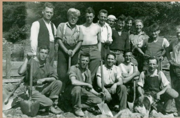
First British project at Brynmawr, Wales, 1931.