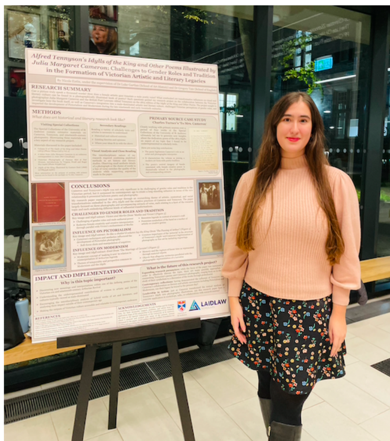
With my research poster after having been awarded the prize of Best Research Poster in the Arts and Divinity Faculty.

After having significantly developed my internal confidence in order to improve how people perceived me as a leader, I found that the more I ‘put myself out there’ – volunteering to give presentations, seeking out new and challenging environments, and gradually stepping outside of my comfort zone – the more people began to take notice of me and my work as a Laidlaw Scholar. Two of my proudest achievements during the programme were being chosen for a Scholar Spotlight profile on the Laidlaw Scholars Network and being awarded the prize for the best research poster in the Arts and Divinity Faculty at the Scholar Celebration event in November 2022. While these recognitions have positively reflected ‘how others see me’ as I progressed on my academic and leadership journeys, neither of these accomplishments would have happened if I hadn’t resolved to be more assertive and take more initiative during my time as a Laidlaw Scholar.