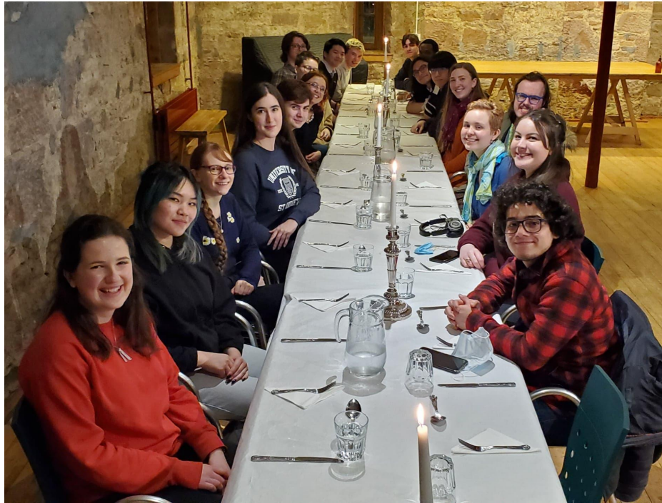
The first night at Hospitalfield – nineteen Laidlaw Scholars hungry for knowledge... and the best food they've had in months.

While discovering who I was and who I could become during the weekend at Hospitalfield gave rise to the first lesson that I learned from my time as a Laidlaw Scholar, the second leadership day in October of that year provided me with the next important insight. During this session, we were tasked with delivering a two-minute 'elevator pitch' about our leadership skills, discussing both our strongest skills and the skills that we would like to develop in the future. The goal of the activity, however, was to learn how to provide positive and constructive feedback to our peers after each presentation. I noticed that when my group would identify the positive aspects of each pitch, they would praise a common set of traits displayed in the presentations. These included clarity, a relatable and personal tone, speaking positively about ourselves, and most of all, confidence. Over the course of the Laidlaw programme, I realised that building confidence is key to being positively perceived as a leader – not only the superficial projection of confidence in high-stakes settings such as presentations, but true confidence that comes from being content with your sense of self.