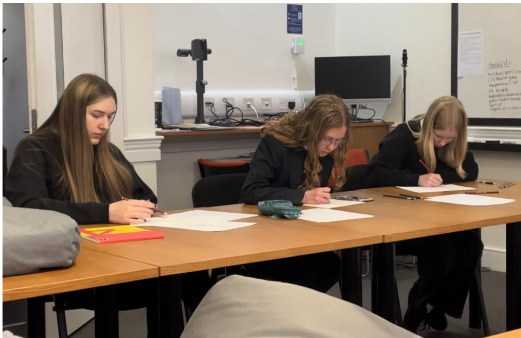
Students from Madras College, St Andrews, participating in my workshop in Martyrs Kirk Library as part of my Leadership in Action project.

organisations, including working with Special Collections on new research projects, being a visiting activity leader at Impact Arts in the coming autumn, and being offered to host an event at Madras College centred on careers in the arts. Therefore, while I hope that my work as a Laidlaw Scholar has provided many opportunities for young people in Scotland by widening access to arts and cultural programming, I have also been offered several opportunities to continue to achieve this audacious goal while exploring potential avenues for future careers.