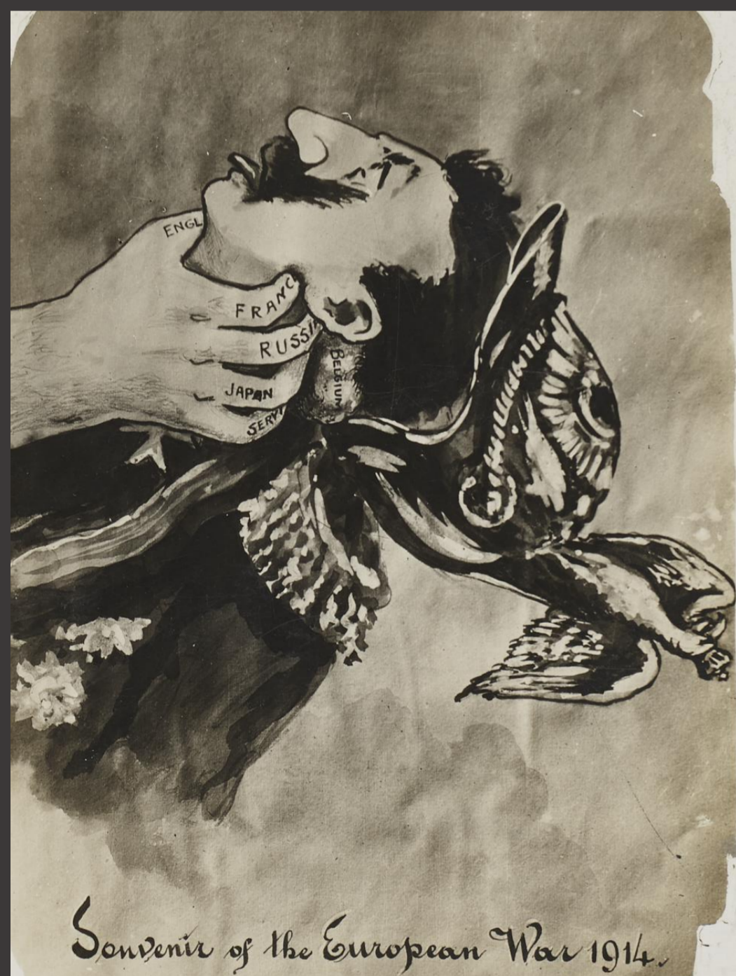
Figure 1: Postcard 'Souvenir of the European War 1914' depicting the strangulation of a German soldier by France, Russia, Japan and England, demonstrating the widespread anti-German sentiment from the earliest stages of WWI.

The German Army is Responsible for Crimes which it did not Check.