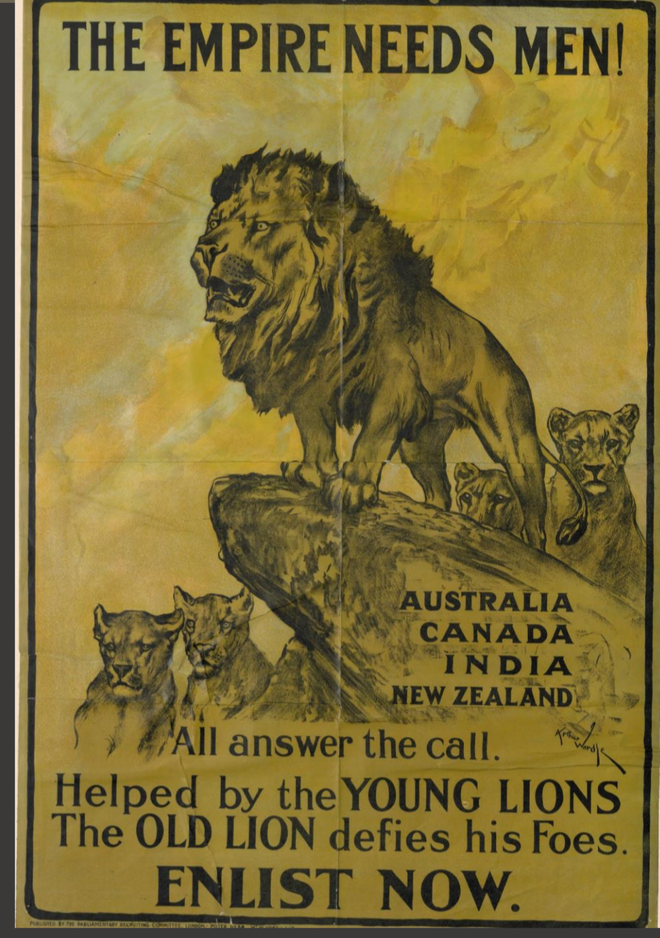
Figure 5: 'The Empire Needs Men', parliamentary recruiting committee poster no. 58 printed by Straker Bros. London in 1915, artist Arith Wardle, illustrating the glorification of Empire during WWI.