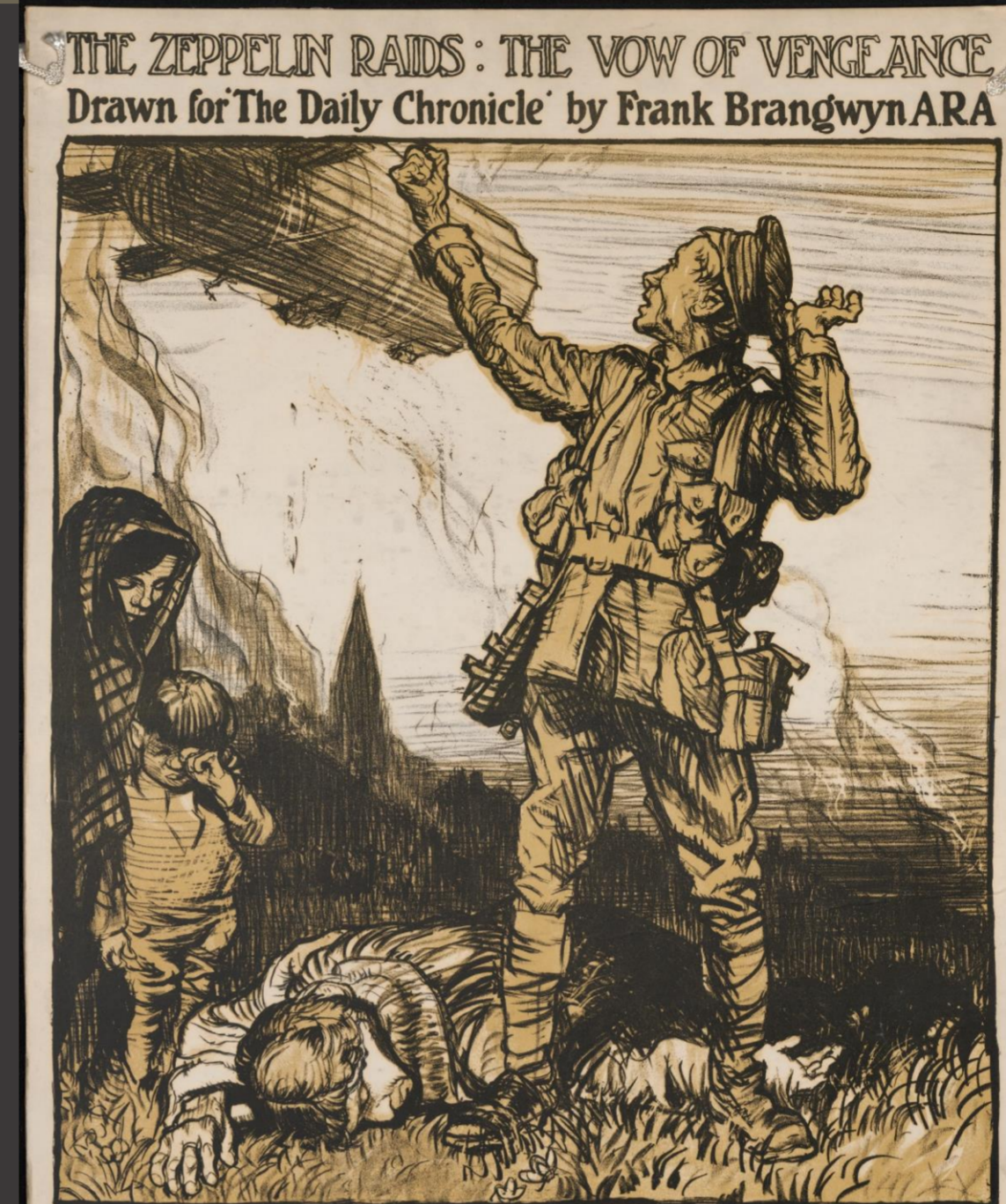
Figure 4: 'The Zeppelin Raids: the Vow of Vengeance' anti-German propaganda poster drawn by Frank Brangwyn for the Daily Chronicle , printed by The Avenue Press Ltd. In 1915.