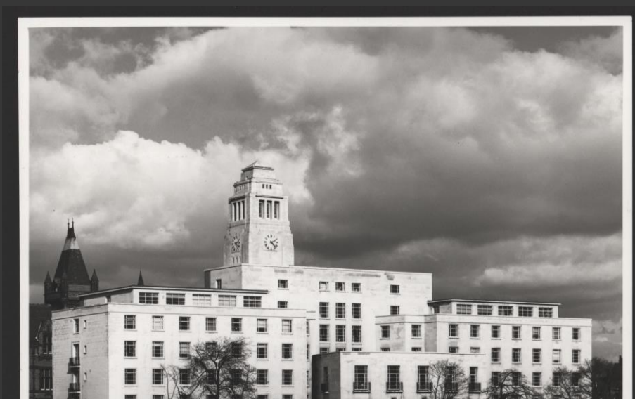
Figure 3: Reproduced with the permission of Special Collections, Leeds University Library, Liddle Collection, LUA/PHC/003/5.

The establishment of German teaching throughout Britain demonstrates the increased awareness of the contribution of German culture, language and identity to wider Europe. However, the blackening of political rhetoric towards Germany, as is conveyed by the perception of Germany's precedence on the world stage as 'dark' and 'dangerous', emphasizes the intimidation of Britain in the face of German success which set the tone for British-German relations entering the 20 th Century, as German cultural domination is perceived as a threat to the status of British culture and identity on the world stage.