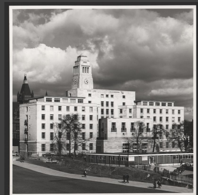
Figure 4: Photograph from the University Archive of the University of Leeds depicting the forefront of Parkinson Building.

References: Special Collections, Leeds University Library, University of Leeds Archive Collection, LUA/DEP/016.