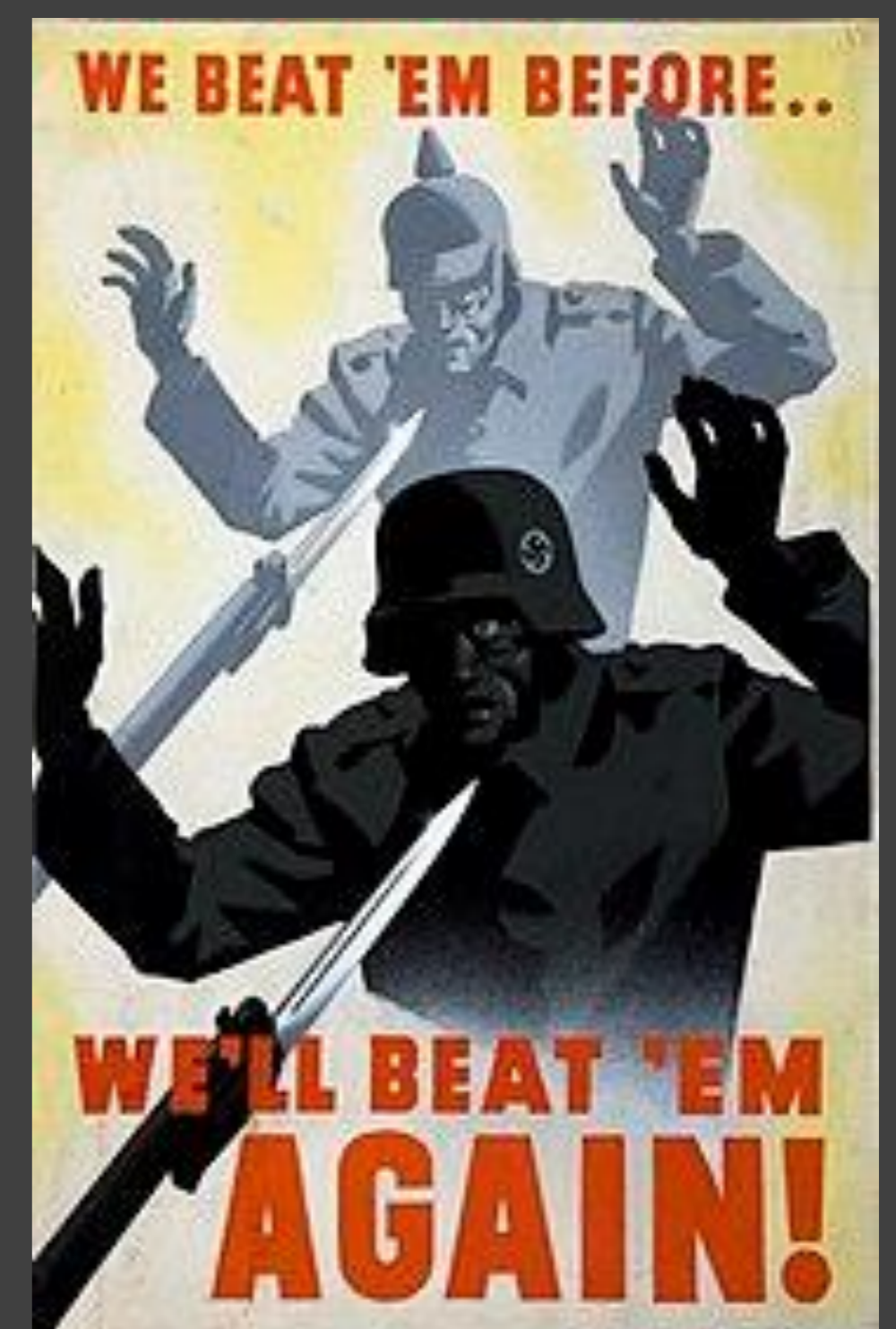
Figure 3: The National Archives, Kew Central Office of Information, Posters Collection, INF 3/140.