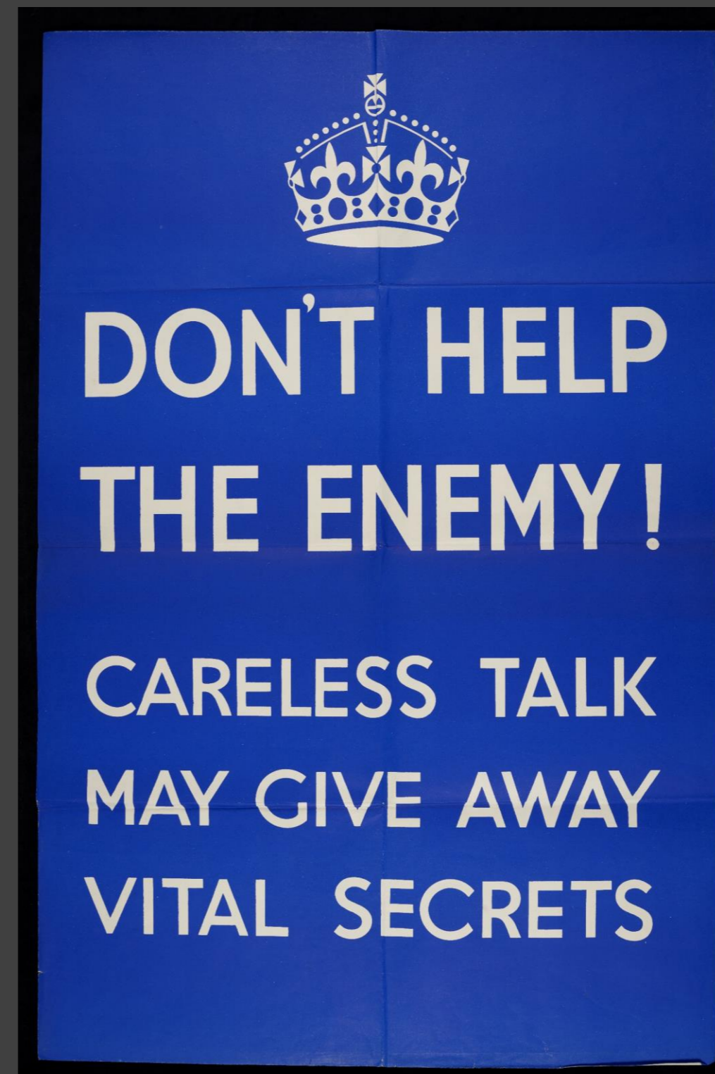
Figure 2: Special Collections, Leeds University Library, Liddle Collection, LIDDLE/WW2/GA/PRB/4.