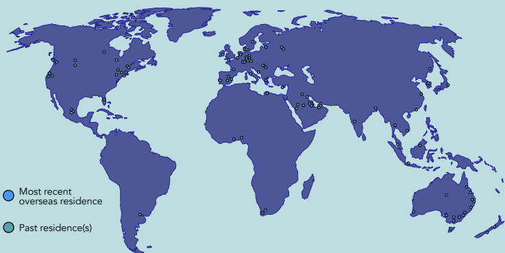
A dot distribution map of my interviewed participant's most recent and past residences

Swearing is also seen as particularly Scottish, and some Scots swear overseas as a result of their Scottish identity, even if it breaks the social conventions of their host country.