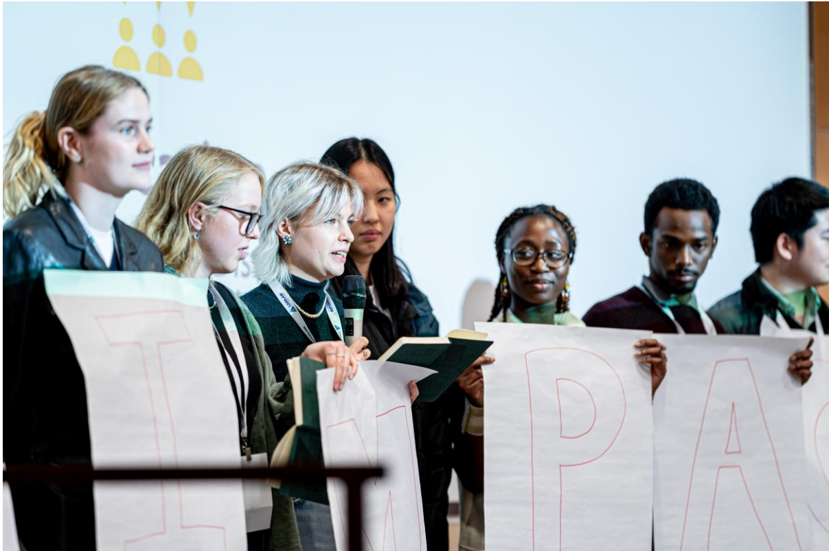
Figure 2: Presenting Impact Acoustic during the 2022 Laidlaw Conference

During the conference, I wrote down several thought-provoking quotes: