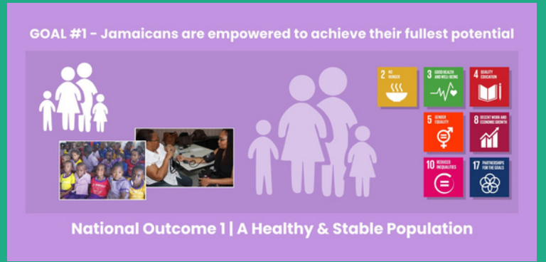
Vision 2030: National Outcome 1

The Summer School was designed for at-risk youths to increase literacy levels, improve self-confidence, and heighten their enthusiasm for pursuing education and activities that could lead to successful careers.