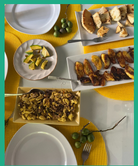
Sunday breakfast: ackee and saltfish, breadfruit, pear and fried plantains