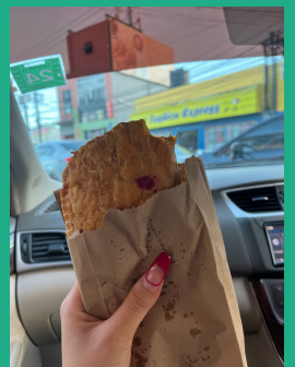
Best Jamaican patties ever from Juici Patties