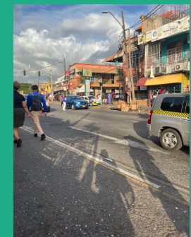
Popular district of Half-Way-Tree, Kingston