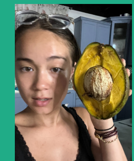
Avocado (pear) the size of my head