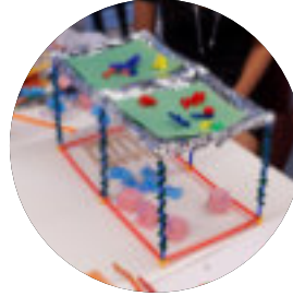
Wireframe proposals envisioned for Maple Leaf Square at 1UP Leaders' Lab.