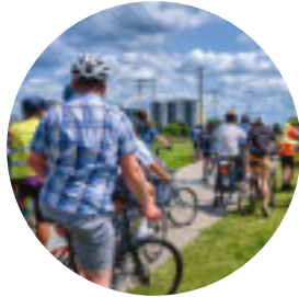
Consulting cyclists on behalf of Bike Share Toronto.

What could the future of urban planners be like? How can youth become more involved in our cities and our futures, instead of being cast aside and dismissed by unimaginative bureaucracies which cause more harm than benefit? My time with Urban Minds explored the potential of high school students as future leaders of urban planning. As a profession with the ability to create immense change in how we interact with communities, I joined Urban Minds for the chance to understand youth perspectives on our environment more clearly. While my role was secondary, I grew in leadership skills through proactive initiative and active communication.