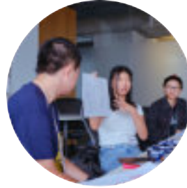
Students discuss street redesign proposals during an office tour of WSP.