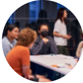
Students listen attentively during group discussion at the 1UP Leaders' Lab.