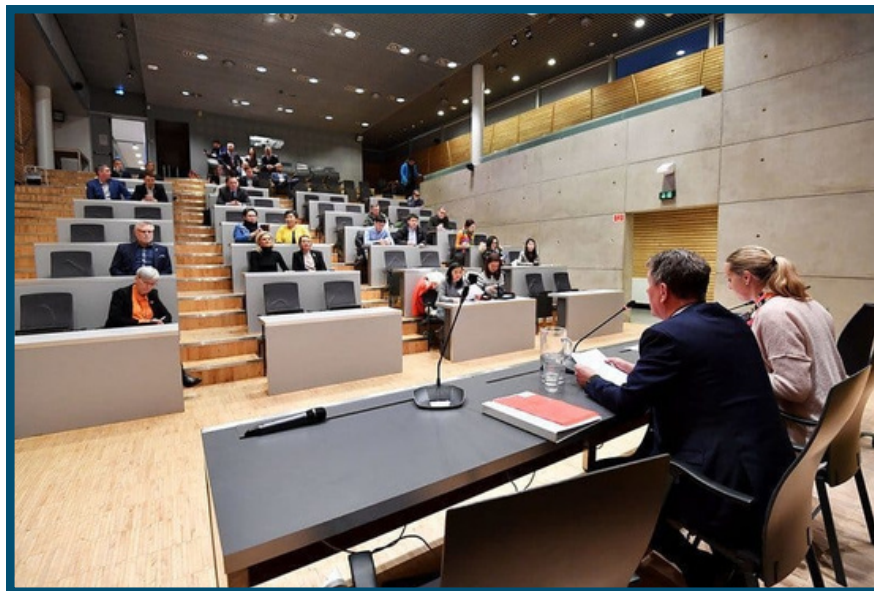
AMF members' meeting in Tromsø City Hall, January 2020.

While at the Arctic Mayors' Forum I did a lot of random tasks for the Secretariat, and also worked on a handful of projects. As a member of the Secretariat I ran the AMF social media accounts, helped with communications, helped coordinate workshops, town halls, and conference talks, attended meetings, helped write and appeal funding applications, and worked to increase the membership of the organization.