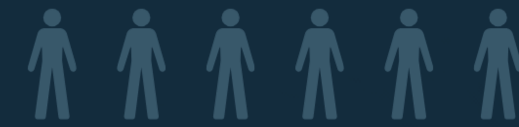
Frequency of Mentioned Integration Challenges Among Ukrainian Refugees in Ireland during interviews

This study engaged with six professionals supporting refugees, exploring diverse perspectives on the integration of Ukrainians in Ireland across various sectors.