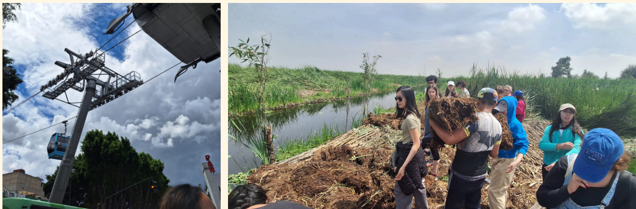
Left: Public transport in Iztapalapa