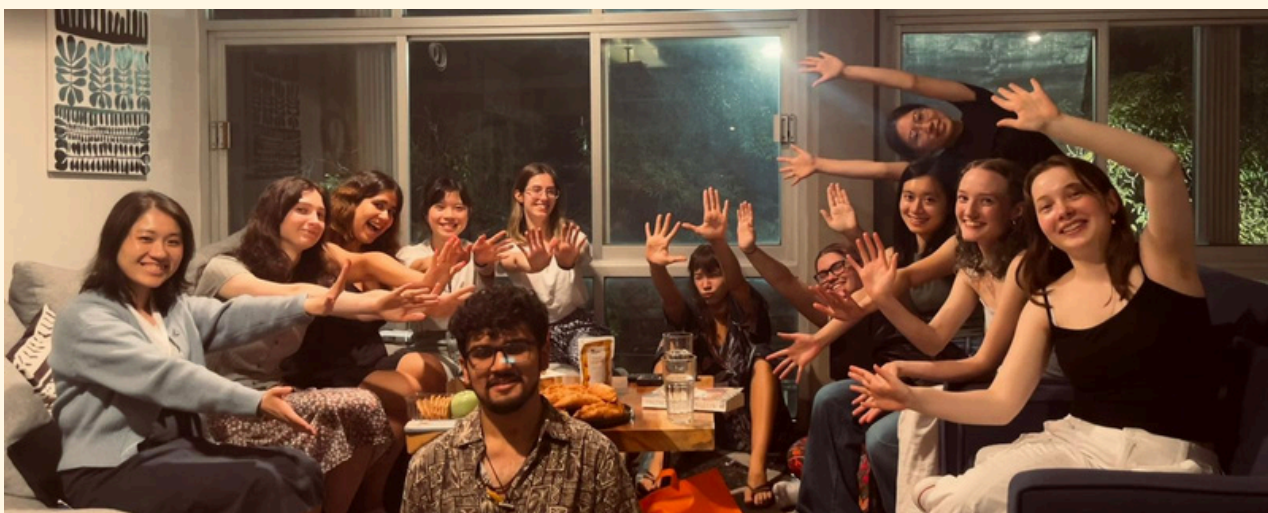
Photo taken when celebrating the birthday of a fellow scholar together in one of the apartments