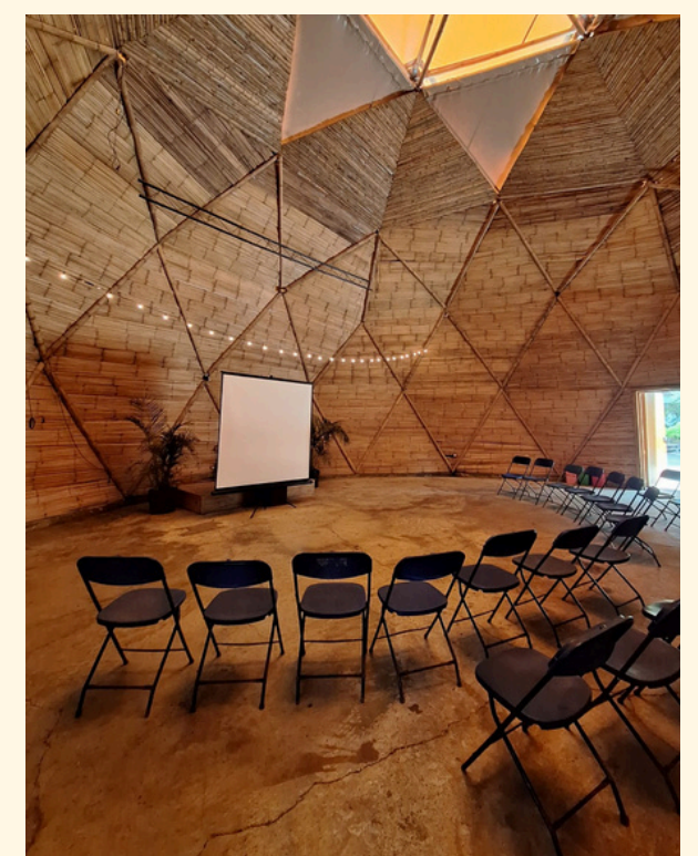
Left: Cover page of the operational manual for (prospective) employees; Right: Photo taken before the start of the networking & focus group event