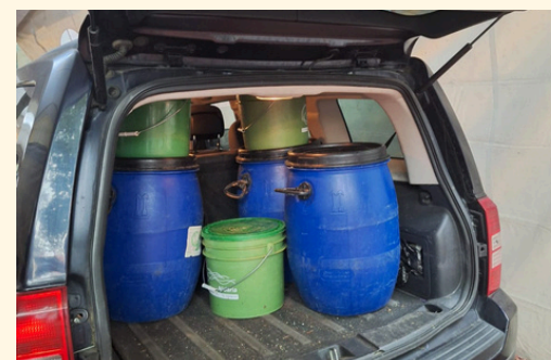
Photo taken during a collection tour: private vehicle loaded with food waste buckets