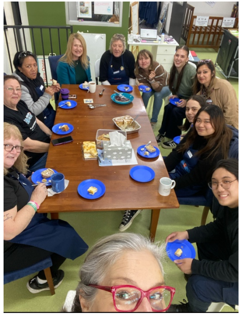
(Koala!! & a goodbye sweet-treat break at Tarneit)