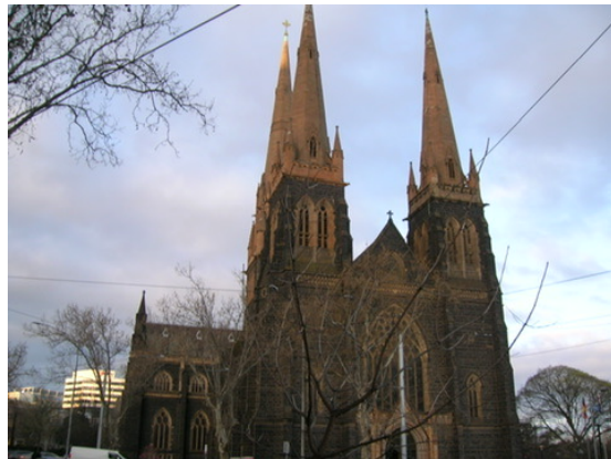
(and some very random photos I took on a post-working from home walk).