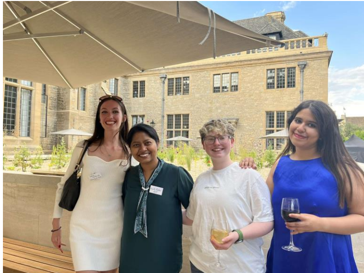
[Drinks reception on day 1 of the conference with my fellow scholars and the Programme Leader at the University of Oxford]

One breakout session, titled "Next Generation Leadership," offered invaluable advice from individuals working on post-graduate programs at the University of Oxford. They emphasized the significance of discovering and adhering to one's values and encouraging personal growth through volunteering and experiences beyond academia. This advice gave me the confidence to pursue and look for volunteering opportunities this summer and now I volunteer bi-weekly at a local food bank in Leeds. It cemented a renewed vigour in wanting to improve myself outside of my grades or academics. I left the conference with a renewed sense of purpose and a commitment to developing my skills and character as a leader. The support of the Laidlaw program made this experience possible, and I am eager to apply these lessons in my future endeavours.