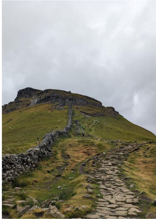
[Pen-y Ghent Mountain top, it doesn't do it justice how tall this was.]

One of the most memorable parts of the trip was scaling up Pen-y Ghent due to my phobia of heights. I felt genuinely nauseous most of the way up this mountain, especially since it was our last main activity of the trip - so many of us were almost sleep-deprived delirium, phone withdrawal, and fear. But I will grudgingly admit the relief and adrenaline of reaching the top was (almost) worth it. What truly made it though was the people, on every residential but especially up that mountain, I relied on the support of my fellow scholars and the Laidlaw staff. Mountain climbing remains not a strength of mine, but what was learned was resilience and leaning on others when you need to. A helping hand or encouraging word can truly go so far, and I was on the receiving end of that. I distinctly remember on the side of Pen-y Ghent, when I was resolutely trying to not look down and also not panic, I tried to encourage my fellow scholars to go ahead, since I was taking it slower, but they stuck by me and I didn't realise till I got to the top how sometimes being a leader is not always about giving someone a solution, but sometimes it is just being there with someone through the process.