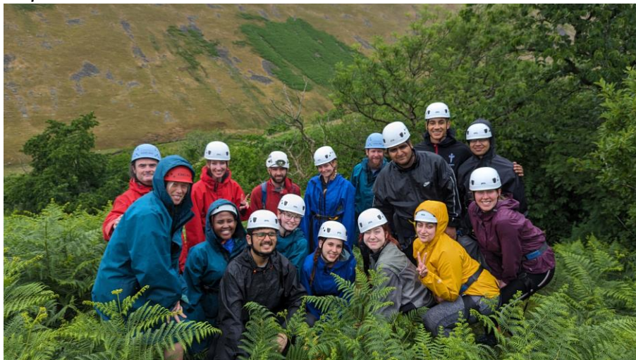
[Ghyll Scrambling with my fellow scholars!]

Our second residential was much different from the comforts of our hotel-stay leadership training weekend as we ventured into the Yorkshire Dales. It was an entirely different challenge to our first residential but was no less fun. From climbing mountains to clambering through caves I feel like I have seen enough of Selside to last me half a lifetime. I will not deny that I am not a very outdoorsy person, so this residential was a challenge for me. This added to the fact we had no phone signal (I wish I could say I do not need my phone, but I absolutely am reliant on it) was a new test in mental and physical strength.