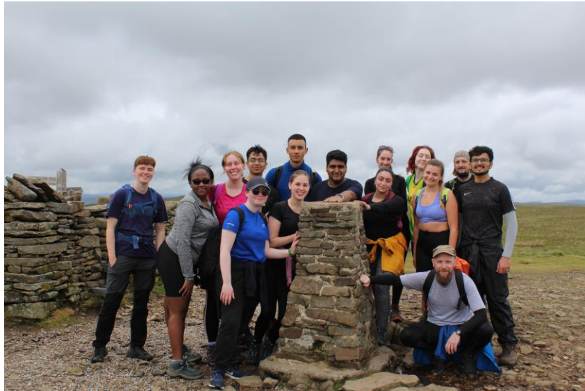
[Completing Pen-y Ghent!]

One of the most significant rewards of this research program has been the friendships I have formed. Throughout the summer, I had the privilege of getting to know a diverse group of scholars who share a passion for research and learning. The camaraderie we built, the shared experiences, and the mutual support have created a strong bond among us. I am excited about the prospect of continuing our journey together over the next year and beyond, and I am confident that these connections will be valuable throughout my academic and professional life. I truly cannot understate the connections that the Laidlaw program has given me, not just amongst my cohort but also from attending events as a Laidlaw Scholar it has allowed me to meet so many brilliant new people.