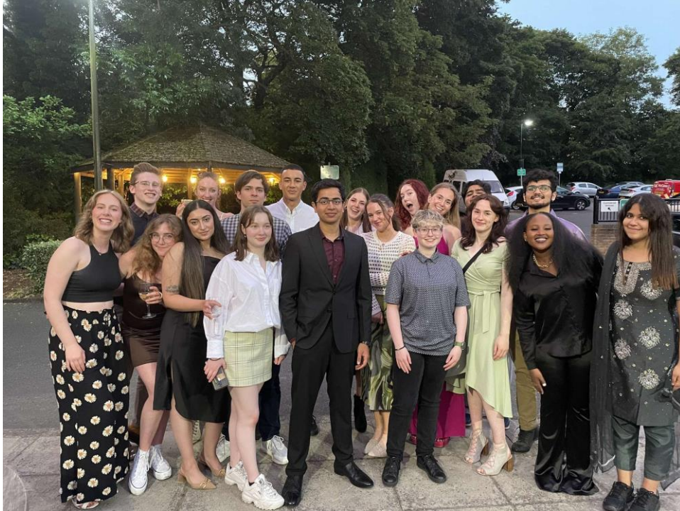
[The Laidlaw Scholars cohort together for the first time]

attended two residential focused on leadership. One of these residential was more challenging than the other but they were both infinitely rewarding (and eye-opening). Our first residential involved a two-day leadership-focused training conference that involved lots of group exercises, introspection, and laughter. It was also the first opportunity for the Uni of Leeds scholars to meet and it was definitely a great experience. We honestly covered too much in those two days to cover here succinctly but we covered skills like networking, management, and resilience in a series of workshops.