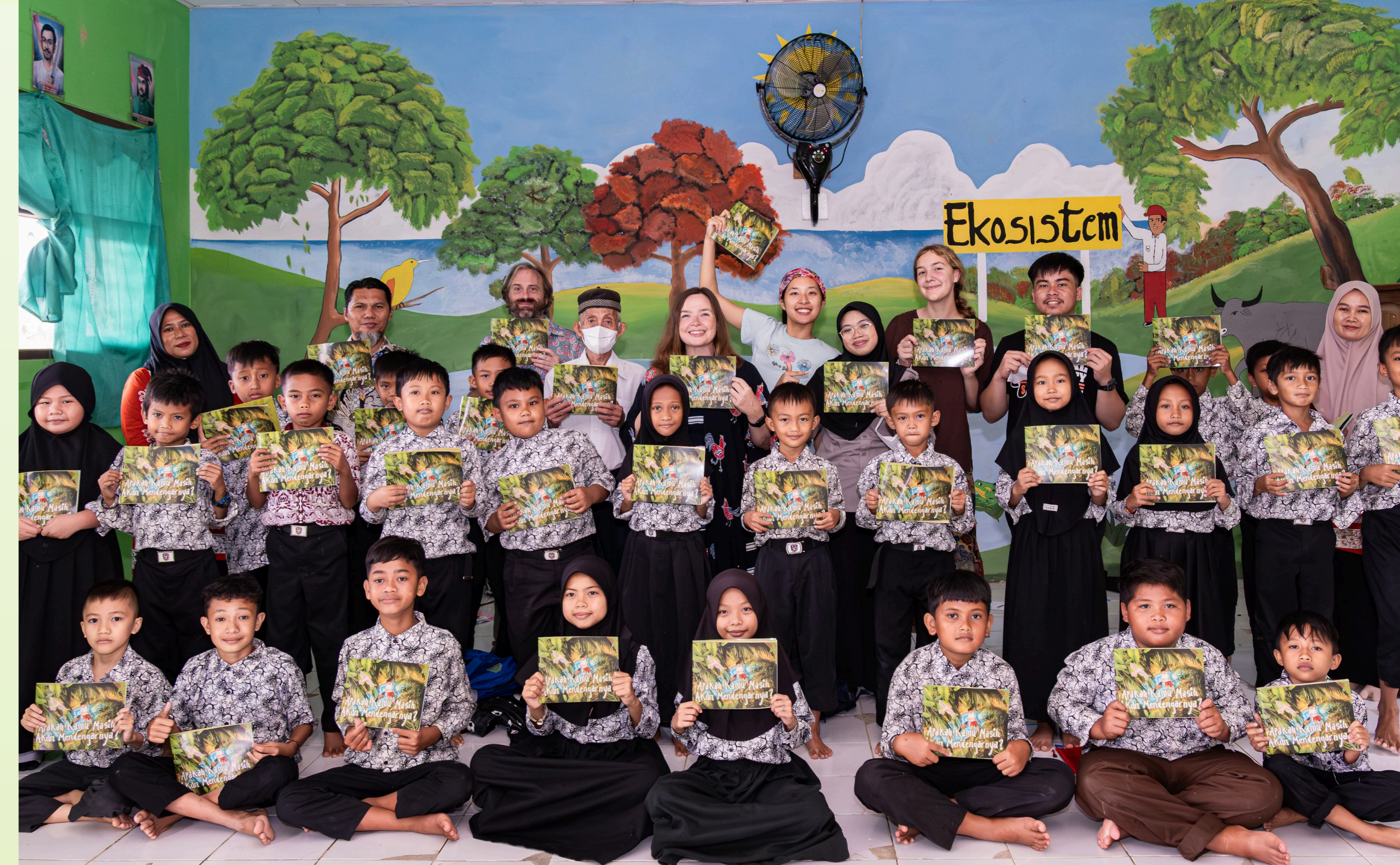
Our Nusantara fieldwork team with students in Mentawir, each with their own copy of the children's book ( Apakah Masih Akan Mendengarnya? )

Indonesia's capital is relocating from the historic city of Jakarta, on the island of Java, to a rural region on the island of Borneo. Major relocation concerns include local and Indigenous residents' land rights and political power, as well as ecological degradation. Since 2022, our international team of natural and social scientists, students, and local community partners have investigated the development of Nusantara and its effects on human and nonhuman communities.