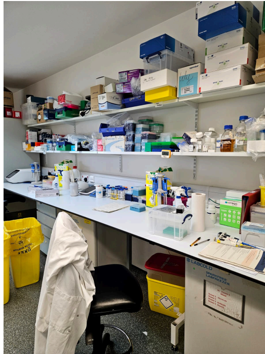
My workbench at UCL GOS ICH during my research project

In the summer of that year came my research project, where I worked at the UCL Great Ormond Street Institute of Child Health (GOS ICH). During my time there, I picked up many new technical skills through the hands-on lab work. Beyond this, I discovered that leadership lies at the core of our daily lives and extends across all fields of work, including in lab research. While conducting my project, I learnt the importance of being critical and proactive in approaching challenges. Some samples that I tested did not yield the expected results. This allowed me to think back and evaluate what could have caused the observations and test out strategies for improvement. I also learnt the importance of discussions in planning out the appropriate next steps and not being afraid to admit mistakes, as this is part of learning.