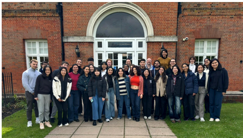
The 2024 UCL Laidlaw cohort at Cumberland Lodge (sadly not everyone could join at that time)