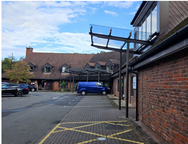
The front of Princess Alice Hospice (they also have a stunning garden inside!)

In between my projects, I had the chance to participate in various insightful leadership workshops, which included the in-person training and the online Oxford Character Project. These sessions enhanced my understanding of the qualities of a good and ethical leader, and how they are implemented in real life. Furthermore, the Laidlaw Scholars Conference 2024 in Leeds, with the theme of 'Curiosity', allowed me to broaden my perspectives on leadership through the speaker sessions, network with scholars from different universities across countries, and learn about their projects, which I found interesting.