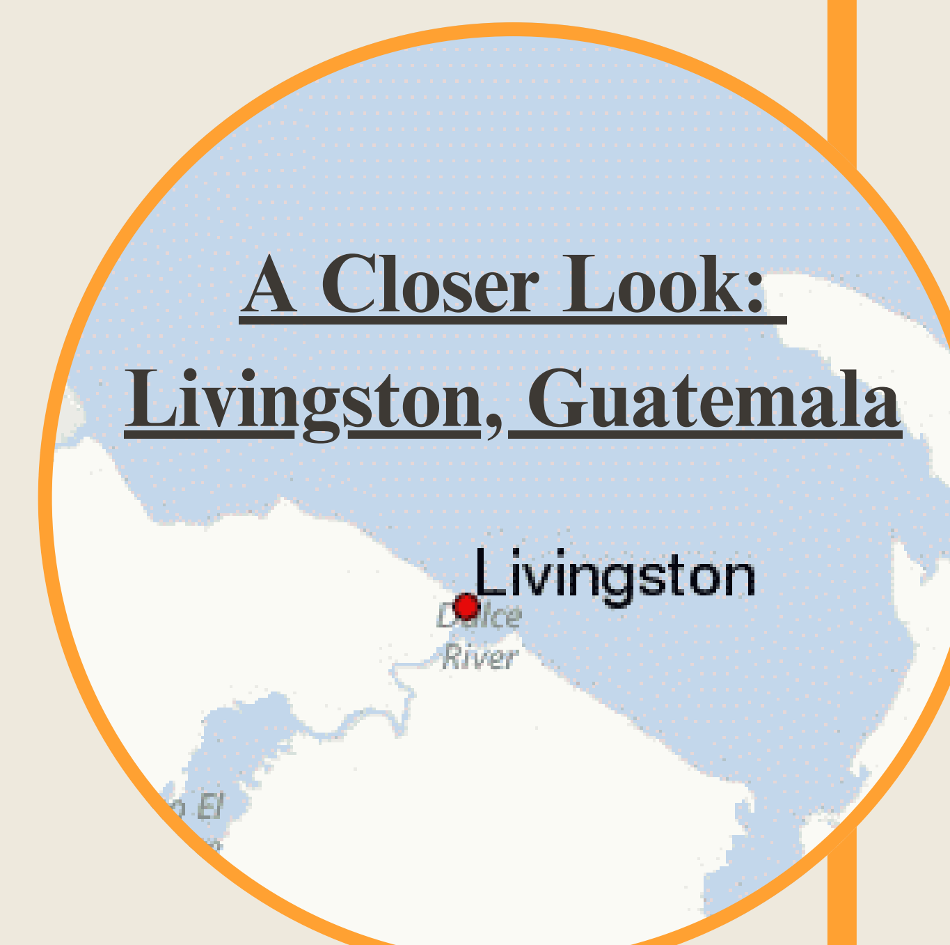
A Closer Look: Livingston, Guatemala

Livingston, Guatemala, is small, vibrant town rich in cultural heritage only accessible by boats, primarily inhabited by the Afro-descendant Garifuna and indigenous Maya Q'eqchi' people ("Garifuna People, History and Culture," n.d.). "In the 1970s, Livingston's Garifuna population was around 10,000 and has dwindled to around 4,000 today" (Amaryah 2022). Their journey began with a shipwreck in 1653 near the island of St. Vincent. The ship, carrying Africans from what we now know as Nigeria, allowed its survivors to escape and integrate with the indigenous Caribbean people, forming a new community on the island (Gudmundson and Wolfe 2010). This union was disrupted in the 17th century when the British invaded St. Vincent. Despite their resistance, the Garifuna were eventually forced to leave for Roatán, an island in Honduras, in 1796. From there, the Garifuna spread along the Caribbean coast, establishing settlements, including Livingston in Guatemala (Amaryah 2022). They resisted colonial oppression through maroon communities, education, legal avenues, and artistic expressions such as music, dance, and more.