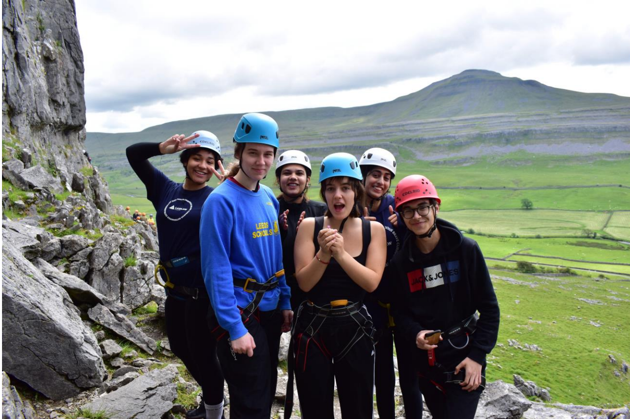
(Pictures from the Residential in Selside, during the climbing activity)