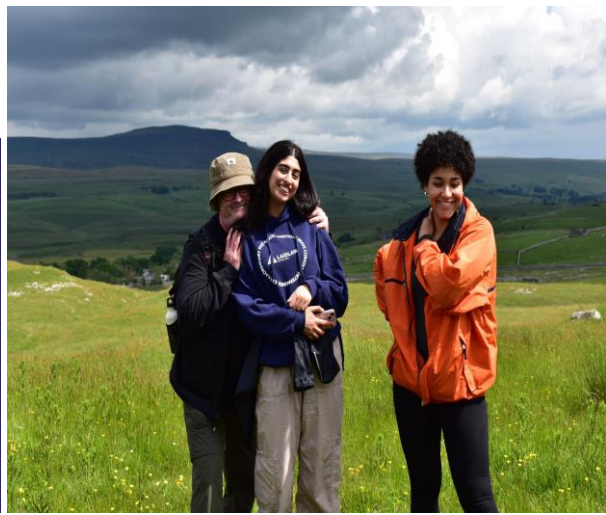
(Pictures from: the Residential in Selside, in the archives Chateau de Vincennes, and the Laidlaw Network)