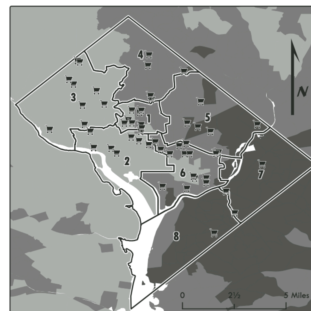
Grocery store locations in DC in relation to percent Black population

Less than 20% Between 20–80% Greater than 80% Based on ACS 2016 5-year estimates